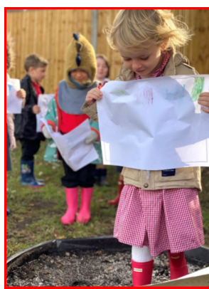
Pupils in Reception acting out a bear hunt around the school, hand drawn maps in hand.