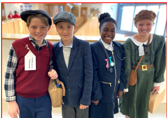
Year 6 pupils enjoying their World War 2 themed day.