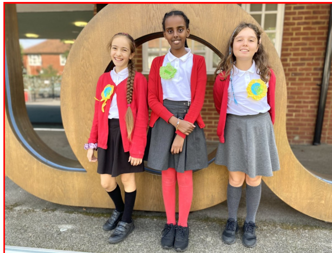
Pupils from Year 6 set up their own political parties and campaigned on important issues such as health and education. They then asked the younger pupils to vote for the party of their choice.