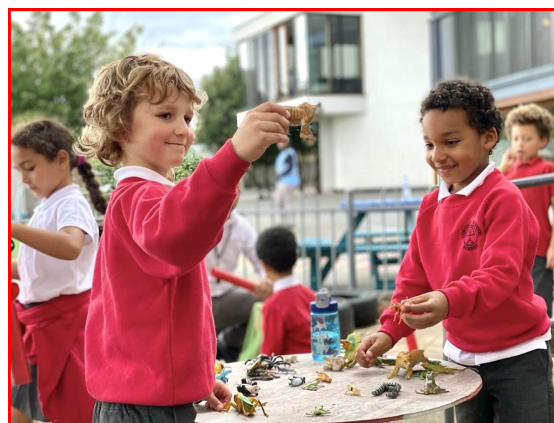
Year 2 pupils making great use of the KS1 outdoor learning area. We are blessed to have a super outdoor learning provision in Key Stage 1.