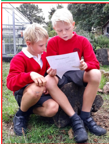
Practicing for the Performance poetry competition

Budget pressures are significant for the school. Whilst there are many benefits to having smaller classes it has a crippling effect on the school budget. Across the school we are 100 children short of capacity. This means the school has an incredible £400,000 less in it's budget than if we had 30 pupils in each and every class. As such, whilst it's a difficult time for all we would like to request your help. Over the course of the year we always try to ensure we provide resources for the children which enrich learning and make it come to life. This is something that is increasingly hard as the school faces real budgetary pressures. As such, we are asking for a voluntary £10 donation from each family for this term which we can use to pay for the extra resources we use in class. This allows teachers to really be creative in the classroom and promote a wide range of learning opportunities. Of course if you'd like to donate more than £10 we'd be delighted and very appreciative. It really does make a difference. Thank you in advance for your fantastic support. You can make this donation through our Virgin moneygiving page