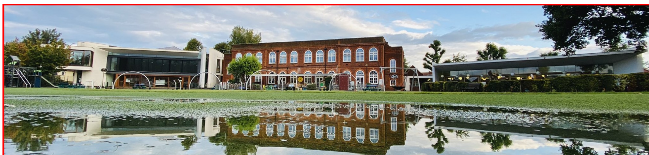
Our school looking beautiful, even on a wet miserable morning.